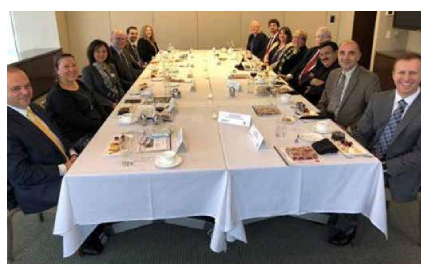
Luncheon with Eastern Europe consulate representatives, November 13, 2017

On Monday, November 13, representatives from Governors State University met with consuls general from seven consulates in Chicago for a private luncheon at the Metropolitan Club of Chicago. Attendees discussed how the university can meet the needs of international students from the eastern European region while growing its enrollment.